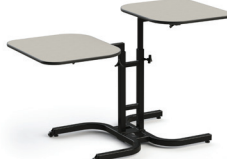
BFL-2-(1/1) 2-Person Adjustable Table