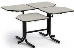
BFL-4-(2/2) 4-Person Adjustable Table