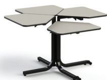
BFL-4-(4/1) 4-Person Adjustable Table