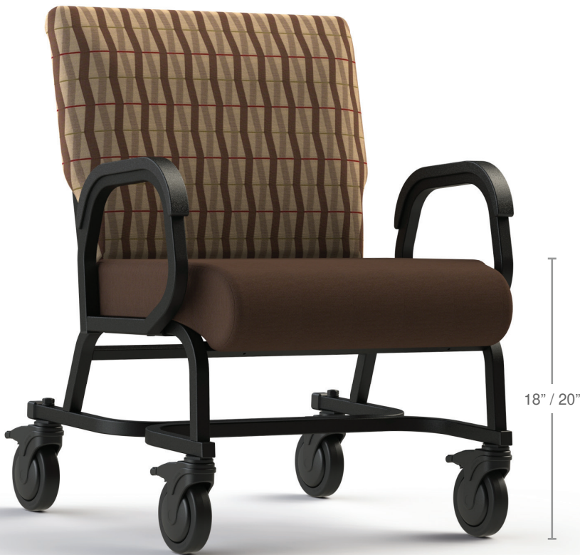
Shown in Algiers All Spice & Hands On Deep Mahogany